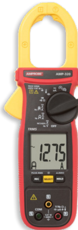
AMP-320 AC/DC Clamp Meter Electrical Motor Maintenance