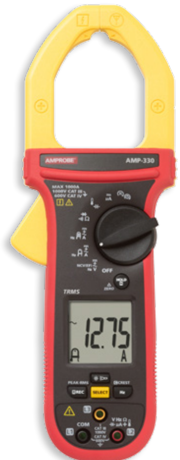
AMP-330 AC/DC 1000 A Clamp Meter Industrial Motor Maintenance