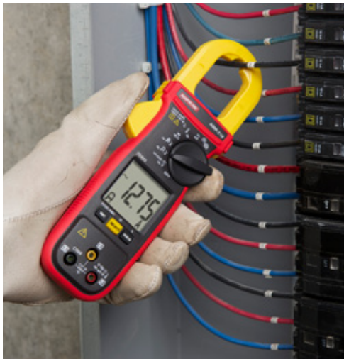
AMP-310 AC Clamp Meter HVAC