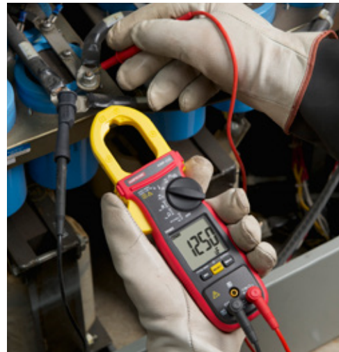
AMP-320 AC/DC Clamp Meter Electrical Motor Maintenance