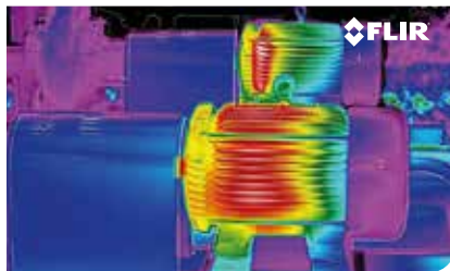
Continuous monitoring of a motor.