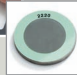
Individual plates are available