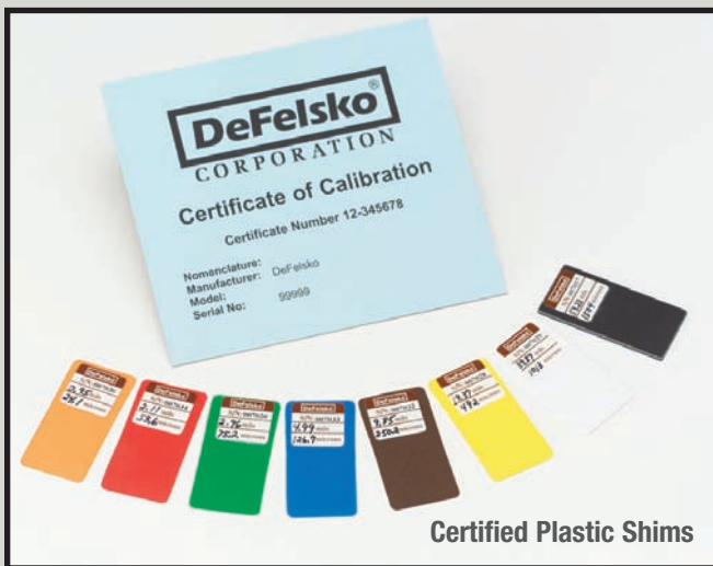
Certified Plastic Shims